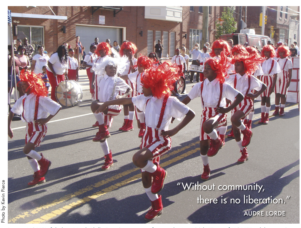
Project HOME's fabulous North Philly Foot Stompers perform at the June 20th "Taste of HOME" celebration (see page 4). The Foot Stompers also won first prize in a national competition earlier in the month.

Non-Profit Org. U.S. Postage PAID Philadelphia, Pa Permit No. 01219