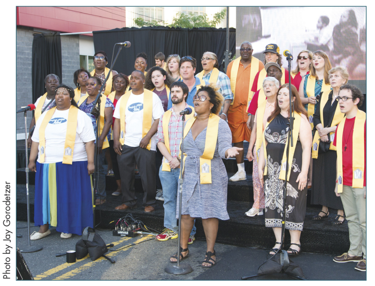
The Project HOME Choir sings at the June 20th "Taste of HOME" celebration (see page 4).

on a recent Saturday at our 1515 Fairmount Avenue residence, we were holding one of our occasional potlatch parties, an informal community arts festival with music, poetry, art, and food. About sixty persons were there, a motley blend of residents, staff, volunteers, and friends. Over the course of the afternoon, folks came up to the open mike for impromptu performances, while others drew and painted at the arts table.