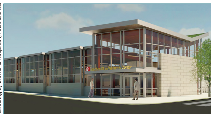
Rendering by Brower & Hauptman, Architects LLC