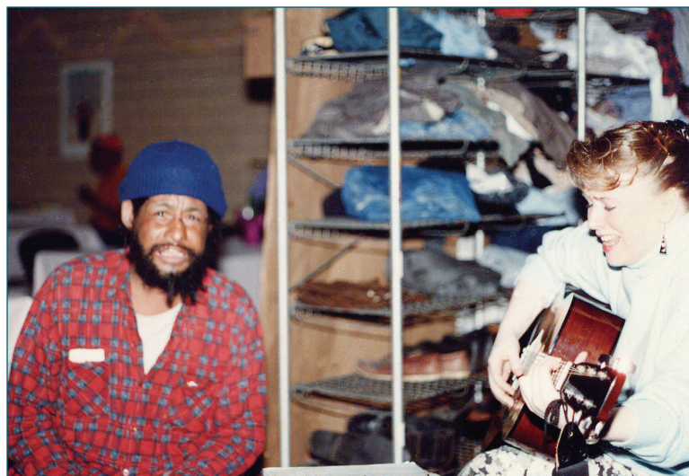
A resident and a volunteer from our very first emergency winter shelter in the winter of 1989, where Project HOME was born.