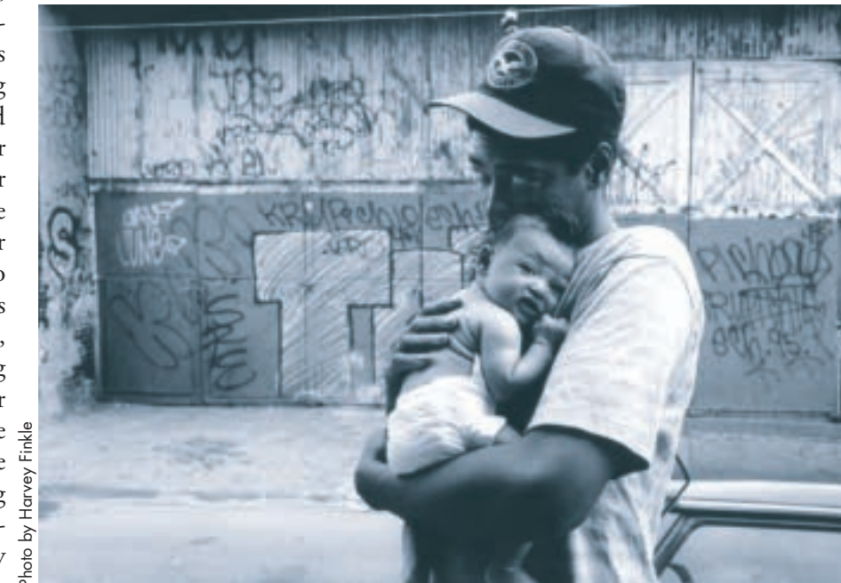
Can the visit of Pope Francis this month spark a new commitment in ending homelessness and poverty in our region?

The papal visit has to be more than a multi-million-dollar spectacle of pomp and civic pride. We would best welcome this remarkable global figure by responding concretely and energetically to his challenge to compassion, mercy, and justice.