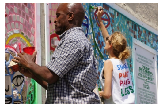
Photos of some of the Francis Fund recipient organizations: Masjidullah, Inc., Joseph's House of Camden, and SREHUP shelter at the Arch St. Methodist Church

In the end, 57 organizations and ministries received grants from the Francis Fund. (See Appendix H for more details on recipient organizations.) These groups represented many sectors of our community, including our various faith traditions – Protestant and Catholic, Jewish and Muslim – as well as many excellent nonreligious nonprofit organizations. They are serving a wide variety of persons, and meeting many diverse and immediate needs: persons struggling to feed their families, persons working to break the cycle of homelessness, persons in recovery from addiction and mental illness, women trying to break free from abuse