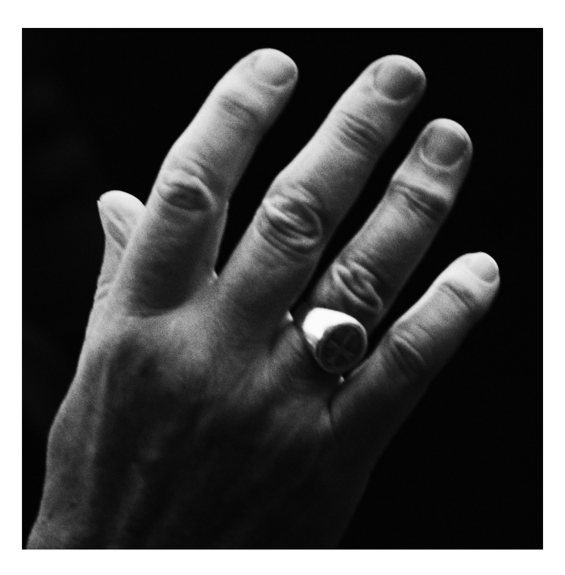
Pope Francis' hand blessing the Knotted Grotto.