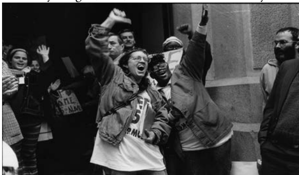
Project HOME residents celebrating the announcement that 1515 Fairmount Avenue could be used as a residence for those experiencing homelessness in 1994

The old song “Amazing Grace” says it well: “Through many dangers, toils, and snares we have already come.