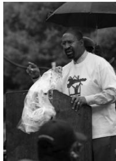
Then-candidate Michael Nutter speaks at Vote For Homes! rally last October 25. Homeless persons, service providers, and advocates are looking to his Administration for leadership to bring about real solutions.

For more information on City United and our efforts to bring about solutions to homelessness in Philadelphia, see www.projecthome.org/advocacy/news.php?id=83 .