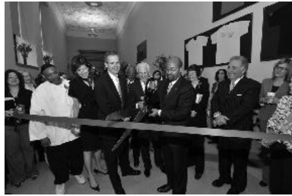
Mayor Michael Nutter cuts the ribbon to mark the Grand Opening of the H.O.M.E. Page Cafe on April 16.

military service. The newly renovated St. E's will provide supportive housing for twenty-four homeless men in recovery, twelve of whom will be veterans. The residence will be more comfortable and functional, creating a positive environment for recovery.