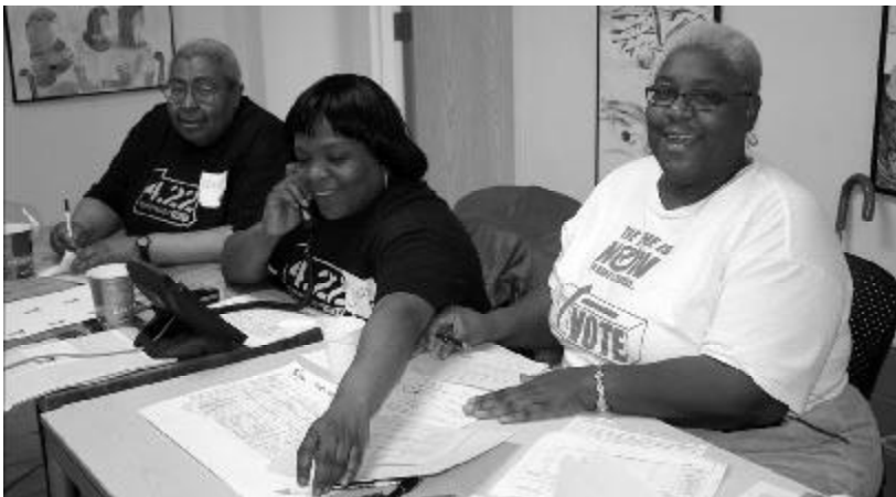
Some of the sixty Vote For Homes! volunteers help to organize the "get out the vote" effort on Primary Election day. Project H.O.M.E. facilitated the Vote For Homes! coalition, which registered 1,100 homeless and formerly homeless persons and ex-offenders this year, and helped 120 people get to the polls.